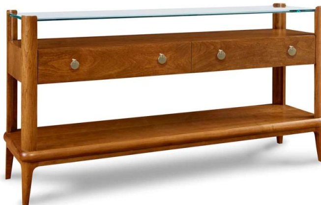
Table for Breastfeeding Area, Console type, wood frame, WOOD top Minimum dimension: 120cm (L) x 40cm(W) x 74cm (H)