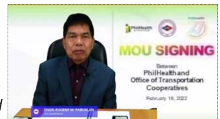
OIC Pabualan during the MOU signing

The two agencies also pledged to continuously work together and exert efforts to ensure the active participation of organizations in their respective programs such as the National Health Insurance Program, Public Utility Vehicle Modernization Program and Cooperativism. ###