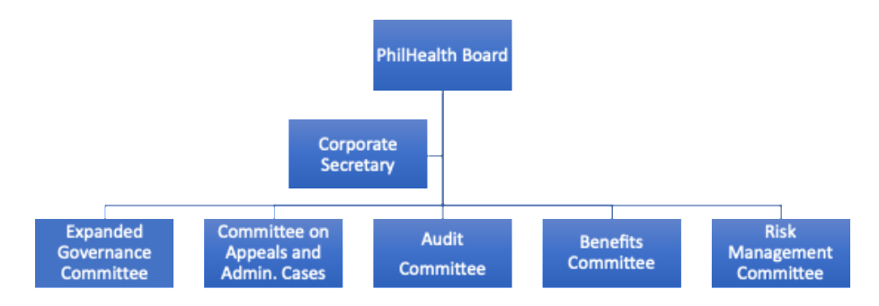
Figure 3: PhilHealth Board Committees, 2020

Prior to filling up the assessment forms, the BMs reviewed the updated active committees for the year 2020 and their accomplishments.