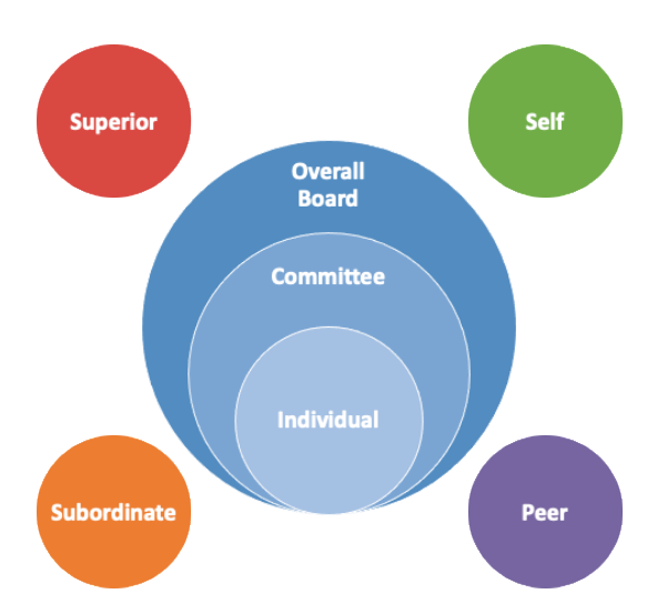
Figure 1: Assessment Dimensions

Figure 1 describes the various components considered in doing the assessment. The process always begins with the individual and how she/he perceives and assesses her/his performance as a member of the board of the organization. The assessment is done along 2 fronts – as a member of the board and its overall performance and as a member of board committees. In addition to the self-assessment, it is also highly encouraged that a superior, subordinate and peer assessment is also done.